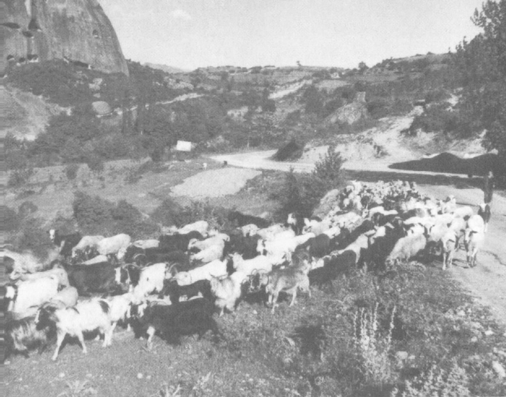
Goat herd on a country road, Epirus