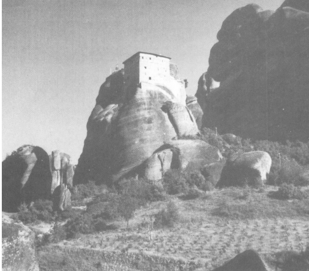
One of the Meteora monastery group, Thessaly, atop a rock pinnacle

percent are Pomaks and Gypsies. The Turkish Muslims are concentrated in Thrace and the Dodecanese Islands, where government funds maintained 205 mosques and two seminaries were functioning in the early 1980s. Alleged confiscation of Muslim religious property has been an issue of confrontation with the Greek government.