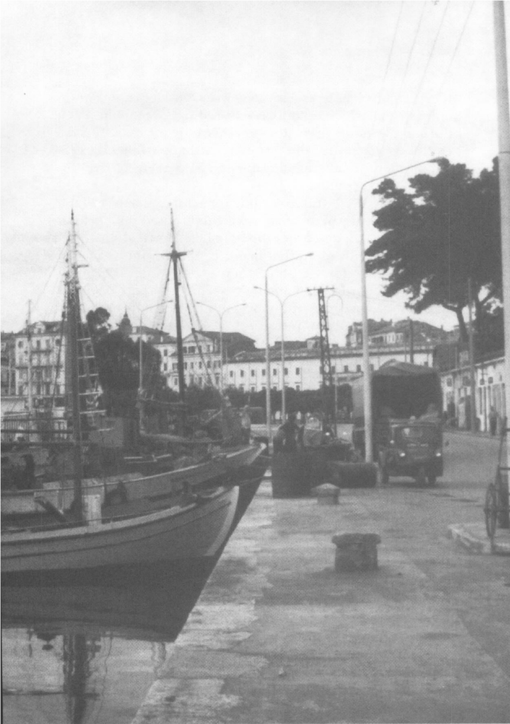
Harbor at Patras, northwest Peloponnesus