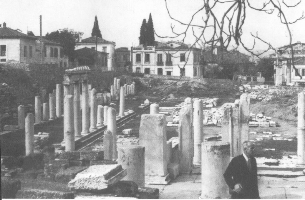
Site of Roman agora, center of economic and social activity, Athens

conomic growth available to wider segments of the population. Widespread poverty persisted despite growth.