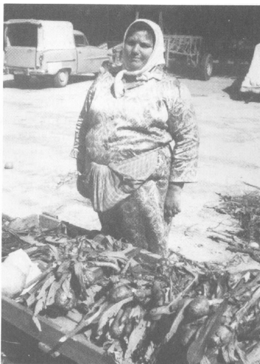
Selling artichokes and quinces, western Peloponnesus