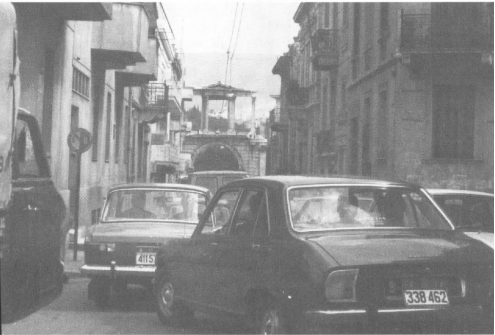
Pizza sign on Santorini (Thira), a favorite tourist destination Traffic jam on an Athens side street