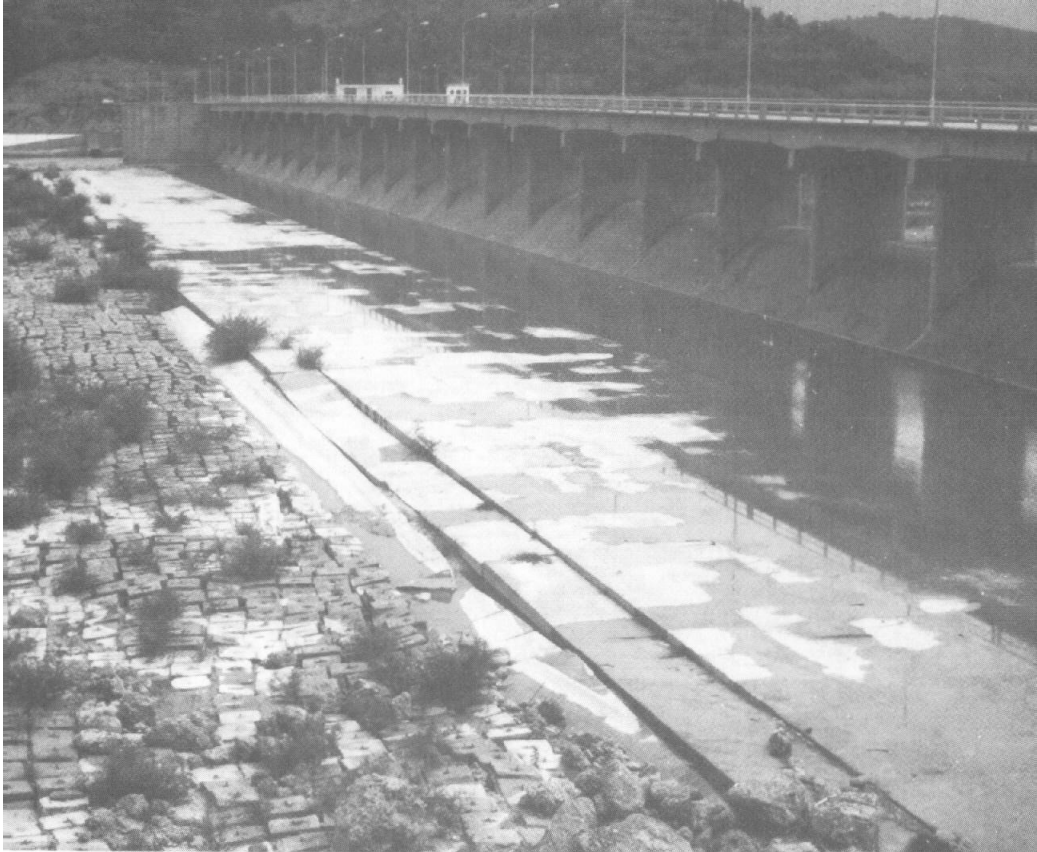
Small hydroelectric dam, Peloponnesus

environment-friendly forms of energy generation such as wind and geothermal sources, extensive automation of generation and load distribution centers, and other technical improvements.