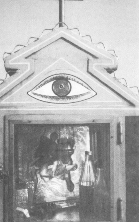
Roadside prayer shrine, Epirus