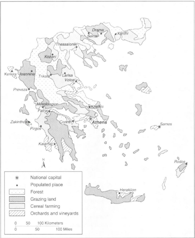
Figure 9. Land Utilization, 1994

in Greece is a major cause of lower agricultural productivity compared with other EU countries. The economies of scale offered by modern farming methods have a limited impact on small plots of land.