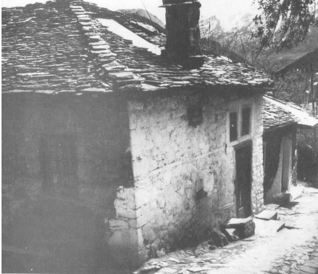
Slate-roofed houses in the Pindus Mountains

into Greece during the millennium that followed. After several centuries of Venetian rule, Crete was taken over by the Ottoman Empire in 1669. After Greece gained its independence, reunification of Crete with Greece became a burning international issue in the nineteenth century. After several uprisings against Ottoman rule and autonomous status between 1897 and 1913, Crete became part of Greece.