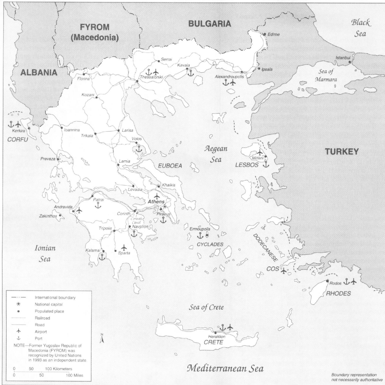
Figure 10. Transportation System, 1994