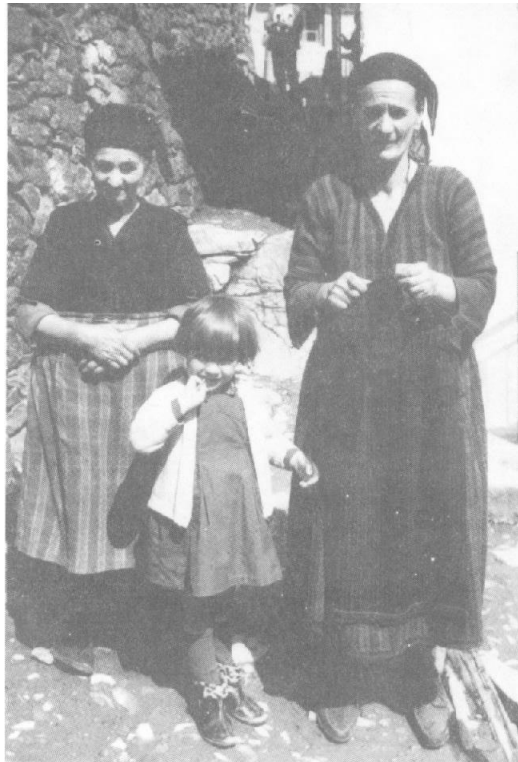
Women in village costume, Metsovon, Epirus

the east, encompassing the southernmost territory of mainland Greece. (Some geographers combine Thessaly and Epirus in their description of Central Greece.) The region includes the island of Euboea (Evvoia), which extends 180 kilometers from northwest to southeast parallel to the east coast of the mainland, separated from the mainland at the city of Khalkis, north of Athens, by a very narrow waterway. The island, which is the second largest in Greece, is formed by an extension of the Pindus spur from the Magnisia Peninsula to its north. Euboea's mountains are interspersed with fertile valleys that produce olives, grapes, and grains, although there are no major rivers. The east coast, which faces the Aegean Sea, is rocky; the island's only harbors face the Vorios Evvoikos and Petalion gulfs between Euboea and the mainland.