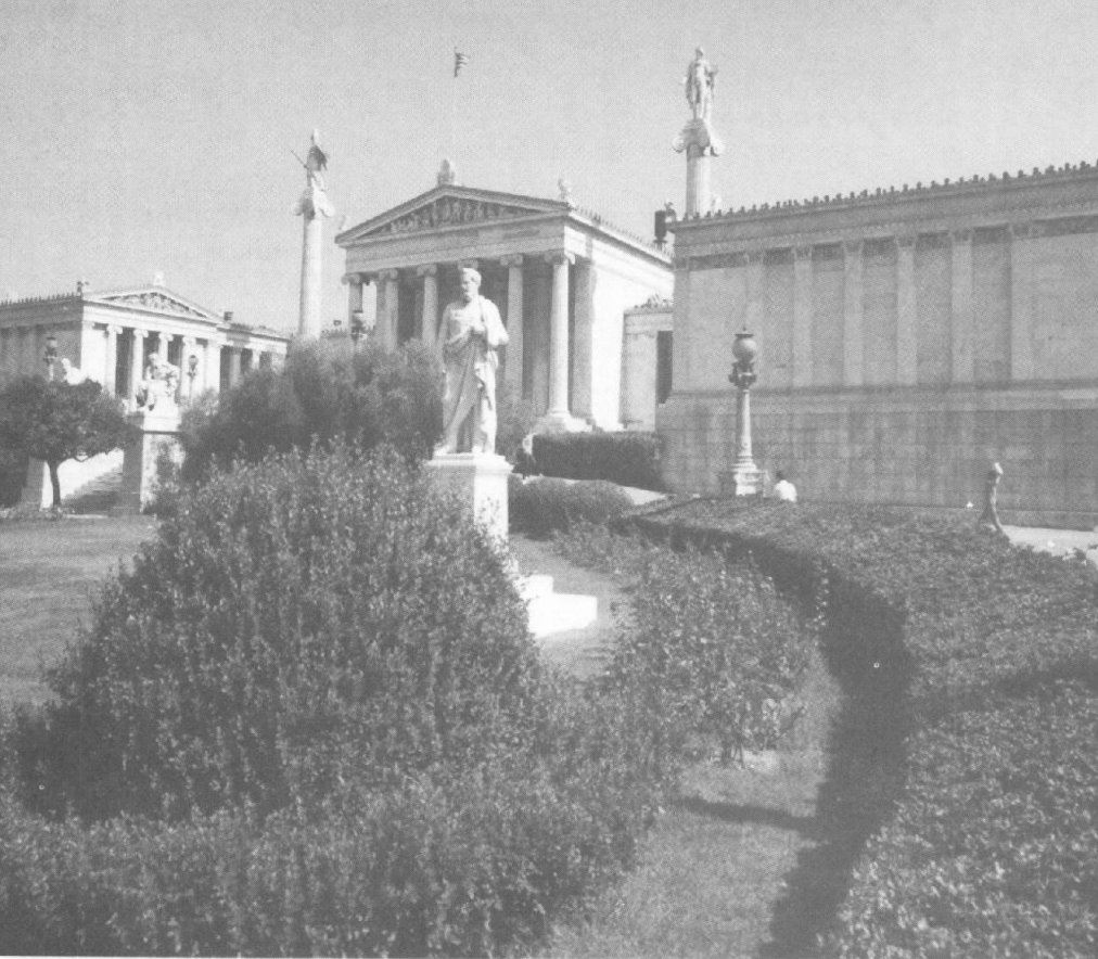
The Athens Academy, national research center for science and the humanities